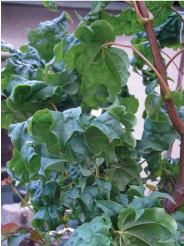
Fig. 2. Acer platanoides 'Beskid' from author's own collection

Flowers and fruit. Original plant has not flowered yet, so information about flower abundance and fruit setting will be completed in the future.