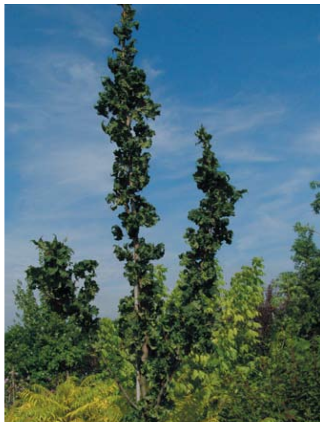
Fig. 1. Acer platanoides ‘Beskid’ from J. B. Szmit collection

Leaves. Leaves are variable in size. Drawings made from squashed and pressed leaves show that they are five-lobed and very similar in size and shape to those of the species, with lobulate lobes as well (Fig. 2, 3). However, drawings made from fresh leaves taken from the tree in early September show all the distinctiveness of this cultivar, both from the species and the other known cultivars. Leaves are strongly undulating on the topside and the lobes are strongly curling underside (circinate) (Fig. 4a). Leaf-blade is somewhat crimped and looks like a “blown sail” (Fig. 4b). Leafstalks are 4 to 10 cm long and as thick as those of the species. Leaf color is fresh green in the spring, but soon becomes dull